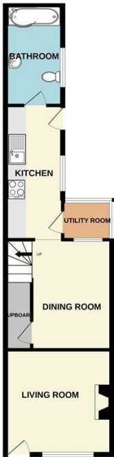
GROUND FLOOR 403 sq.ft. (37.4 sq.m.) approx.